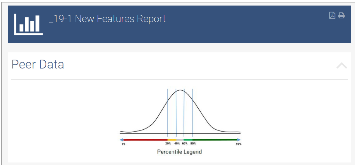
An example of the new Image card