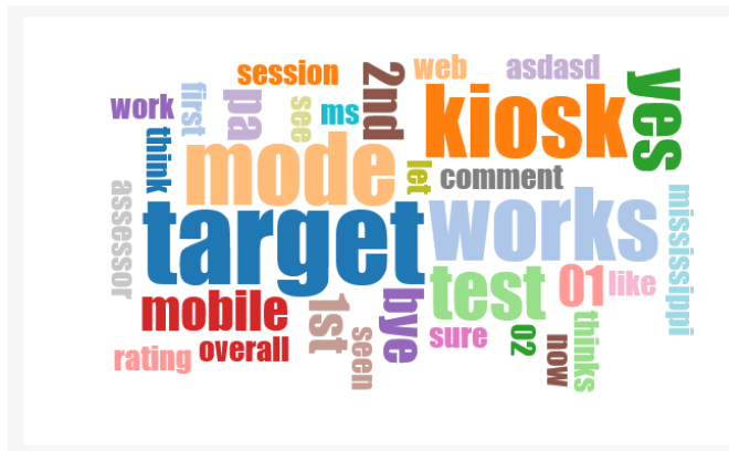
The colorful new word cloud option for Comments!

Display CPR Data in Detail Data Grids ... CPR data is now available in DDGs, so you can design CPR reports in addition to viewing a person's profile page.